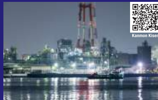
Regular night-view cruise services in Dokai Bay