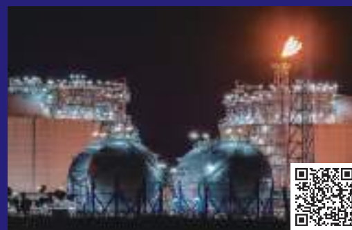
Koyo-machi, Wakamatsu Ward