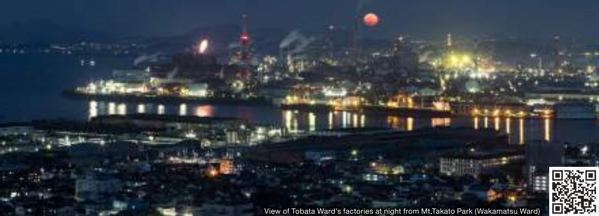
View of Tobata Ward's factories at night from Mt. Takato Park (Wakamatsu Ward)

Kitakyushu also offers various ways to enjoy a factory night view, for example, from an observatory park, from across the sea or river, or from a boat.